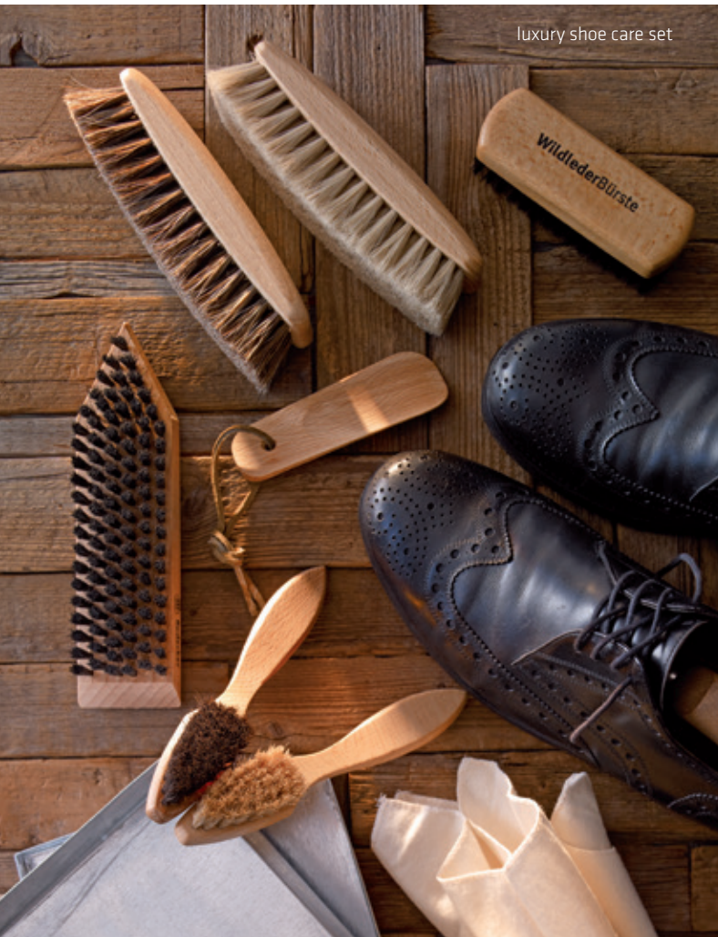
luxury shoe care set