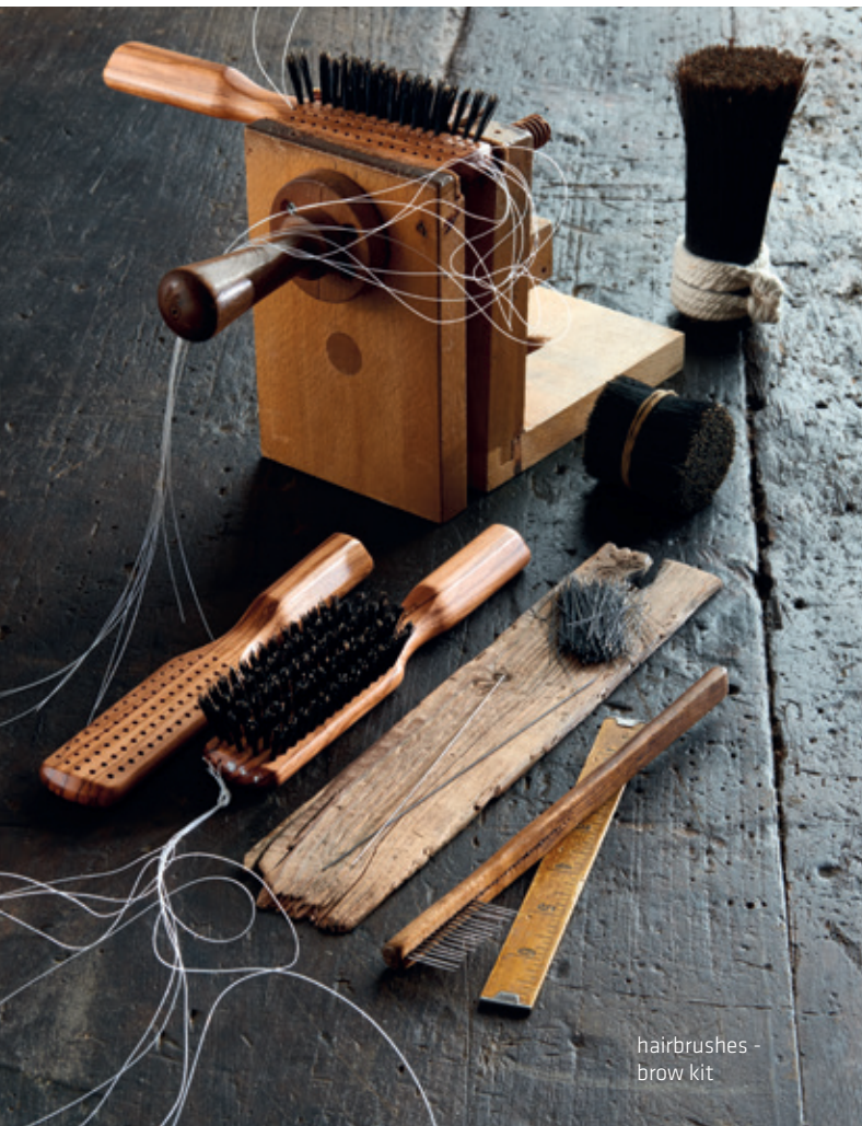
hairbrushes - brow kit